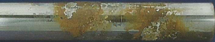
General corrosion from exposure to a marine environment.